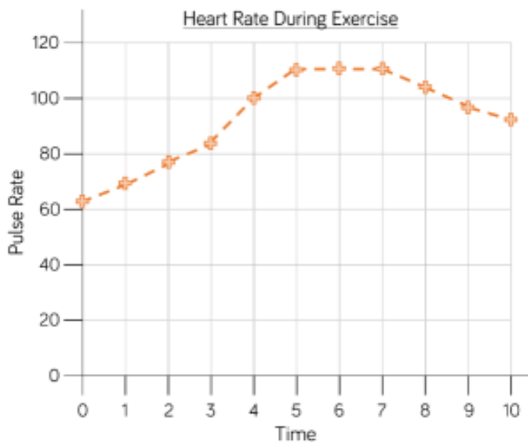
Heart Rate During Exercise

How long did it take for the pulse rate to reach the highest level? Explain your answer, using the graph to help.