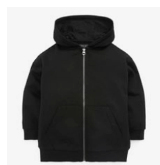
✗ no hoods