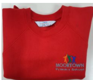
✓ school top (sweatshirt/cardigan/jumper; plain or logo)