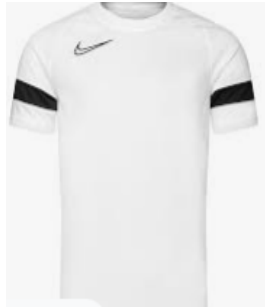
✗ no bands