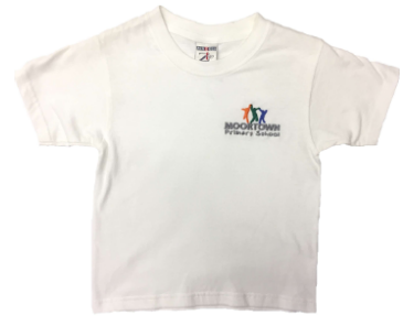
✓ school logo