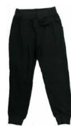
✓ plain grey or black bottoms