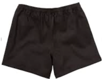
✓ plain grey or black