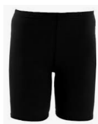
✓ plain grey or black