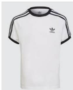
✗ no stripes