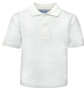
✓ white polo