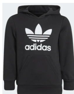
✗ no brand logos