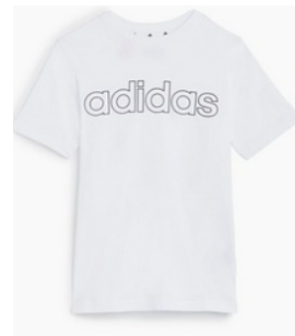
✗ no lettering