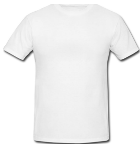
✓ plain white